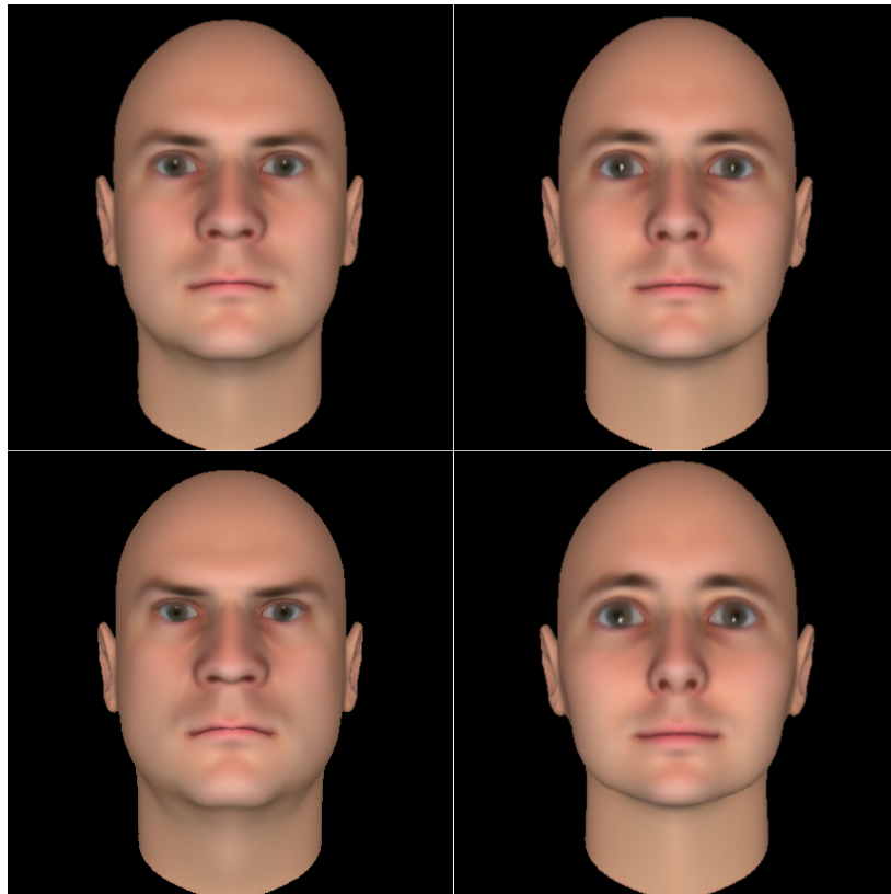
Figure 1: Sample dominance and trust stimuli. Row 1, Left is a sample low intensity dominant face; Row 1, Right is a sample low intensity trust face; Row 2, Left is a sample high intensity dominant face; Row 2, Right is a sample high intensity trust face.

After watching the video, participants completed the manipulation check questionnaire followed by the trust-dominance preference task. Finally, participants completed a brief demographics form (including age and gender), were thanked for their participation and were debriefed.