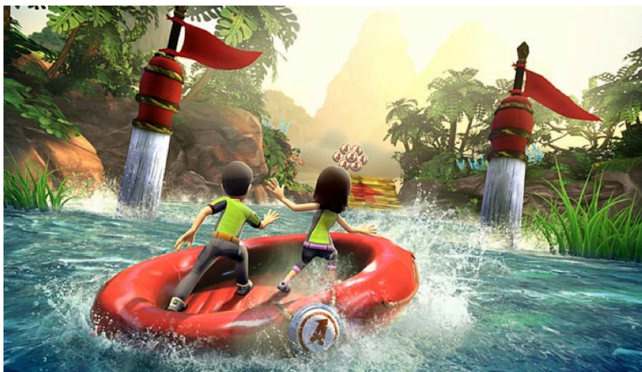
Figure 1: A screenshot from River Rush

The Xbox 360 is a video game console developed by and produced for Microsoft. The Kinect is an add-on sensor device of Xbox 360 that enables users to control and interact with the Xbox 360 by using gestures and spoken commands. The postures and movements of users are projected on a TV screen that is connected to the Xbox 360 and the Kinect. A video game River rush that is appropriate for children of preschool age and above was chosen. In this game, two players facing the Kinect sensor stayed in a designated area marked by a square of green tape. Their characters were represented on the screen, standing in a raft (see Figure 1 for a screenshot from the game). By jumping together, the players started their journey in the raft, rushing down a river. They can control the raft by moving their bodies. For example, to steer the raft the players need to lean their bodies from side to side or they can jump to leap the raft into the air. Players can also earn some points by catching the coins in the air or going between some particular markers. The goal for the players is to keep the raft in motion and earn as many points as possible. Each course of journey lasted about 3 or 4 minutes. In the end, a score would appear on the screen showing how many points each player had earned during the round.