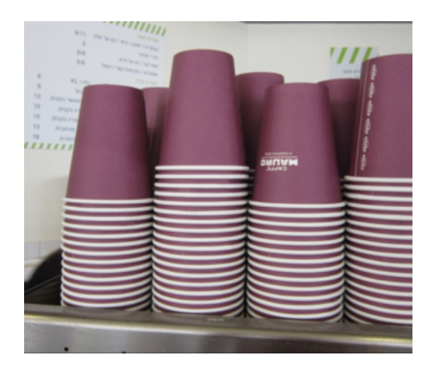
Figure 1 - Coffee cups on display at 'Brunch' and 'Arthur'

Next, 1,053 students (55% female) were observed in 30 classrooms. In 13 of these classrooms, observations were conducted by naïve observers who were not aware of the study's hypotheses. Observation measurements included date, hour, course, professor, department and weather. Observers counted the number of males and females in the class, noted how many of them had coffee with them, and the brand of coffee they had.